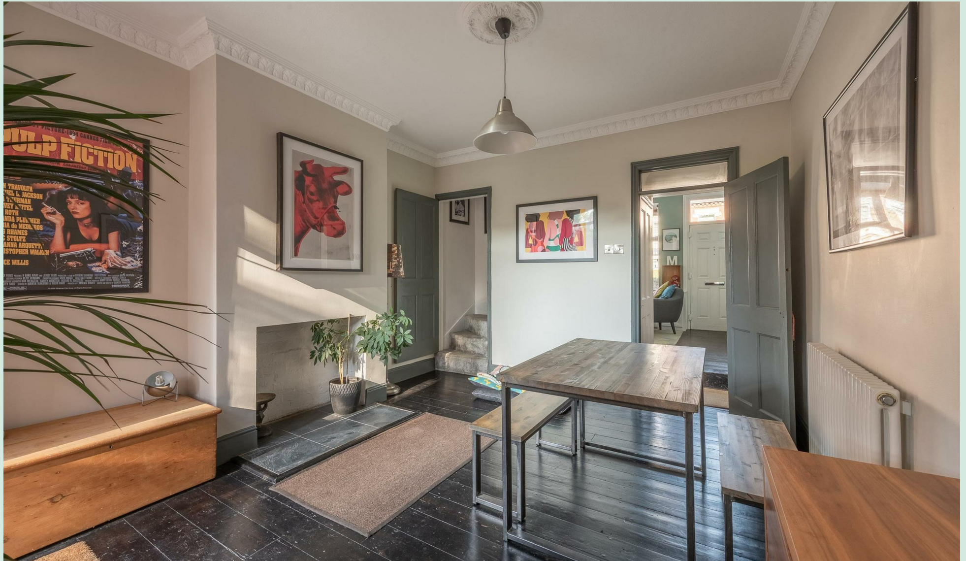
EARLS COURT ROAD HARBORNE, BIRMINGHAM